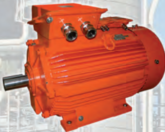
Non sparking EExnA