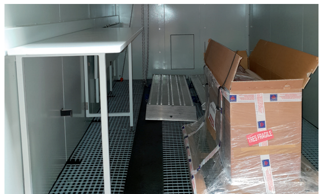
Fully equipped workshop: ramp, lifting bridges, workbenches, special extraction tools, ...