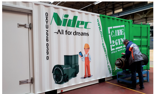
One workshop for all the restoration stages of your alternator (washing, steaming, varnishing, ...)