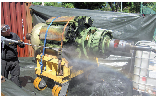
Creation of a washing station