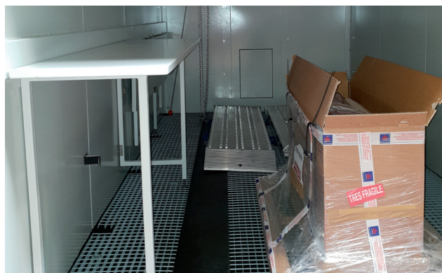
Fully equipped workshop: ramp, lifting bridges, workbenches, special extraction tools, ...