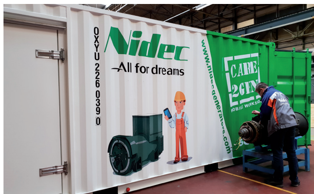
One workshop for all the restoration stages of your alternator (washing, steaming, varnishing, ...)