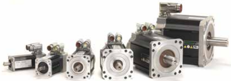
The Unimotor hd family ranges from 55 mm to 190 mm

Unimotor hd has a high power to weight ratio, meaning that it can be easily integrated into the smallest, most demanding applications such as industrial robotics, pick & place and packaging.