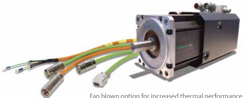
Fan blown option for increased thermal performance